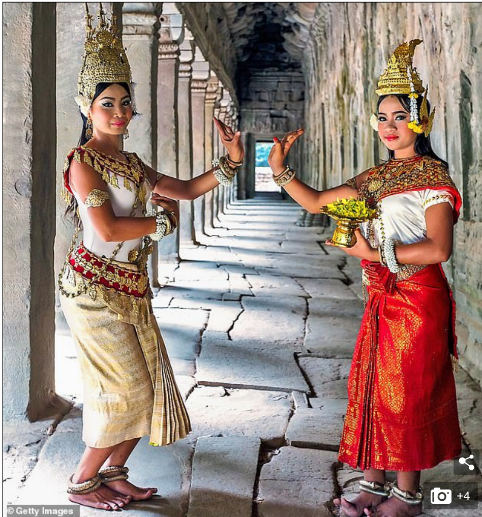
Sacred: Apsara dancers, pictured above, in ornate traditional dress