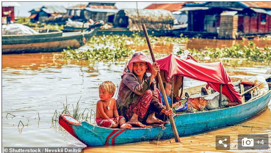
A mother with her child pictured on Tonle Sap Lake, the largest body of fresh water in South-East Asia

Nine miles south of the city, this is the largest body of fresh water in South-East Asia. Home to as many as 90,000 people, who inhabit stilted or floating houses, this biodiversity hotspot is an essential resource for Cambodia and a popular tourist attraction.