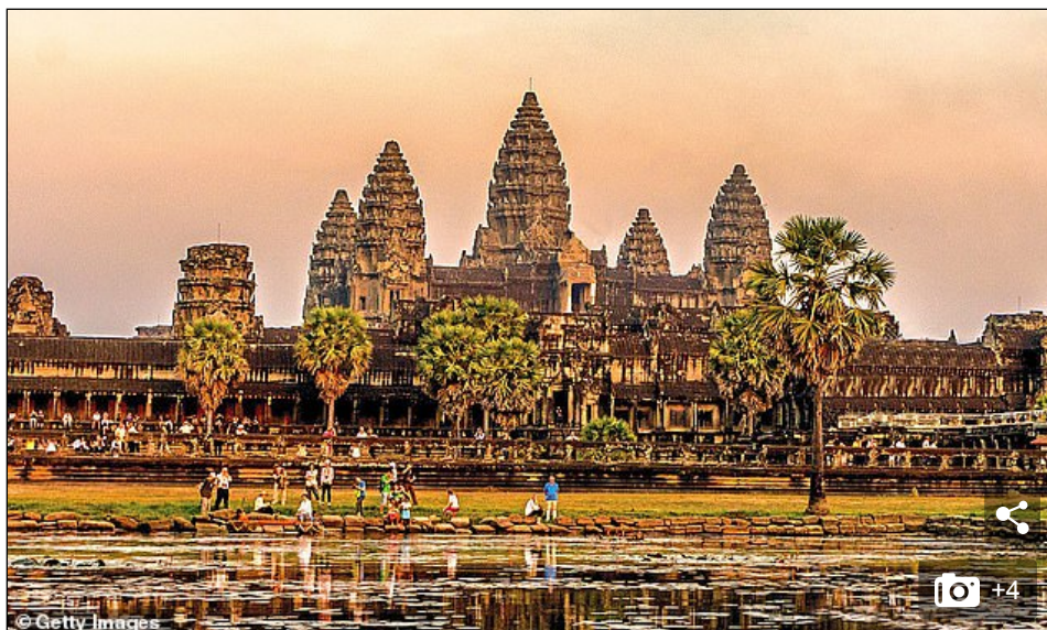
Classic Cambodia: The country's national symbol Angkor Wat

This is Cambodia's national symbol, built in the 12th century by Khmer King Suryavarman II as his state temple and capital city. Dedicated to Vishnu, the Hindu god, it is surrounded by a 190m-wide moat and took 300,000 labourers and 6,000 elephants almost 30 years to create.