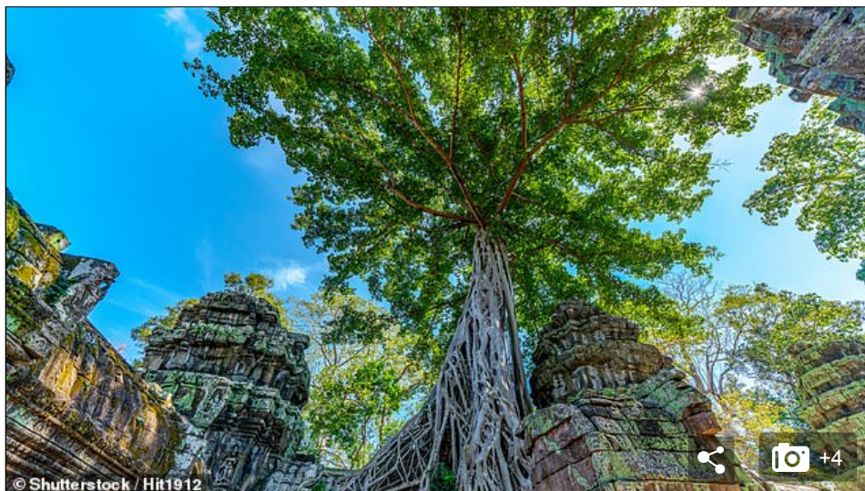
The ruins of Ta Prohm, above, covered by Tetrameles trees in Angkor

Five minutes from Angkor Wat, down a dusty road where parrots screech overhead, is the eerie Ta Prohm. This 12th-century Mahayana Buddhist temple, dedicated to the mother of King Jayavarman VII, has been all but devoured by nature. Deciphering where the remains of the monastery begin, and the strangulated root formations end, is impossible but compelling.